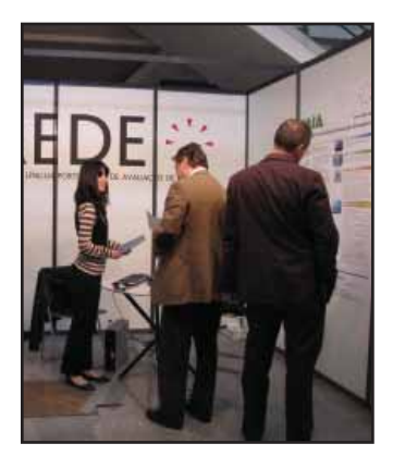
REDE's booth at "The Development Days."

IAIA's Portuguese Affiliate, APAI (Portuguese Association for Impact Assessment), recently launched a Web site in support of its new initiative, the Portuguese Language Network for Impact Assessment ("REDE," or "Network" in Portuguese). The vision for this project is to set up a network of professionals and institutions involved in different types of impact assessment, using Portuguese as their communication language. The mission is to contribute to the advancement of innovation and communication on the best practice in all forms of IA in the Portuguese language space and to the promotion of Portuguese as an international working language in the field of IA.