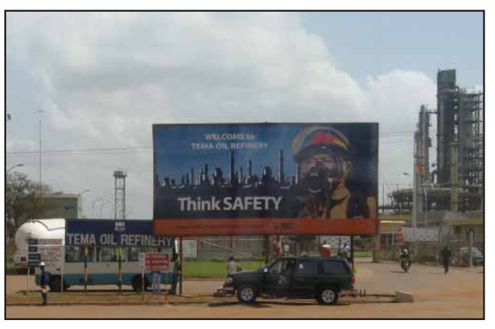
Tema Oil Refinery: Safety first!