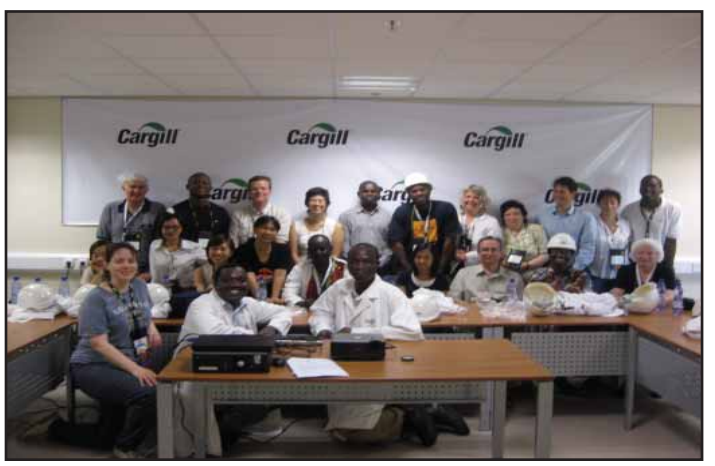
Participants in the Tema Industrial Port technical visit.